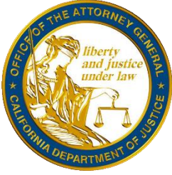
XAVIER BECERRA ATTORNEY GENERAL